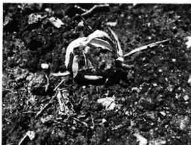
Figure 3a. Shepherd's crook.

Soil Compaction and Sidewall Compaction. Physical restriction from compaction, including sidewall compaction, can result in coleoptile damage or inadequate elongation of the mesocotyl. 6