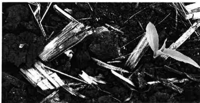
Figure 3b. Premature rupture of the coleoptile and 'leafing out' may look like a 'shepherd's crook' (3a) and can be caused by crusted soil and chilling injury. 6

Cloddy or Sandy Soils. The coleoptile senses light, the mesocotyl signaled to stop elongating. This normally occurs when the mesocotyl is approximately 3/4 inch below the soil surface. Cloddy, dry, or sandy seedbeds can allow light to hit the coleoptile when the mesocotyl is more than 3/4 inch below the soil surface. The leaves continue to expand below the coleoptile causing it to rupture. The exposed leaves then struggle to penetrate through the soil for successful emergence. 6