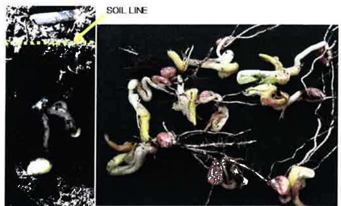
Figure 2. Under conditions such as prolonged exposure to cool soil temperatures, the mesocotyl can grow abnormally resulting in premature rupture of the coleoptile and leafing out below the soil surface. [5]

Emergence. Visual signs of germination include swelling of the seed, elongation of the radical, then growth of the coleoptile. 1 Roots grow down and the shoots (the coleoptile and mesocotyl) grow up due to geotropism, which is plant growth in response to gravity. The coleoptile is a shield that protects the contained seedling leaves as the shoot is pushed through the soil due to elongation of the mesocotyl, which is the white internode tissue between the seed and the coleoptile (Figure 1). When the coleoptile senses red wavelength light, plant hormones sent from the coleoptile to the mesocotyl are altered, halting growth of the mesocotyl. The coleoptile normally senses light approximately 3/4 inch below the soil surface.